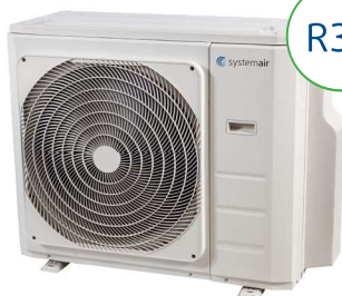
MULTI4 36, MULTI5 42